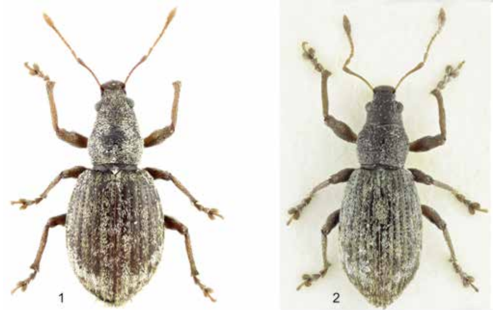
Figs. 1–2: 1) Chiloneus cycladum , habitus (paratype); 2) C. winkelmanni , habitus (holotype).

BIONOMICS: The holotype was collected under stones, and one paratype was found on bulbs of Drimia numidica (JORD. & FOURR.) J.C. MANNING & GOLDBLATT.