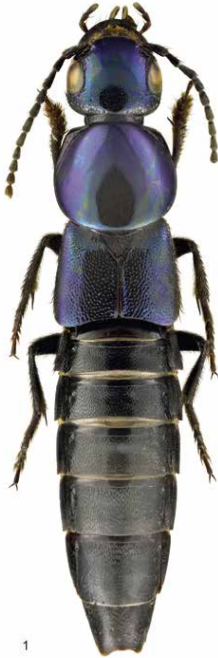
Fig. 1: Algon caeruleosplendens , holotype, habitus.