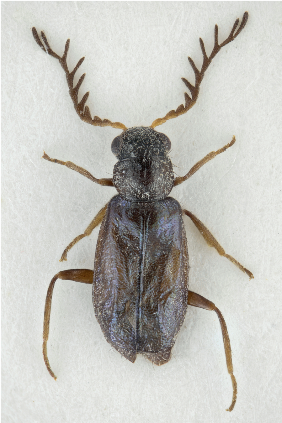
Fig. 1: Dromanthomorphus schoenmanni , holotype.